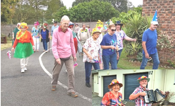
FOREVER YOUNG: Gonubie Glen Retirement Village seniors participate in the Annual 5km Spring Walk which started and finished at the Gonubie Glen Centre hall in East London recently.

Residents of the Gonubie Glen Retirement Village in East London participate in the Gonubie Glen Annual 5km Spring Walk as a form of social activity and exercise to promote an active lifestyle and well-being over the weekend.